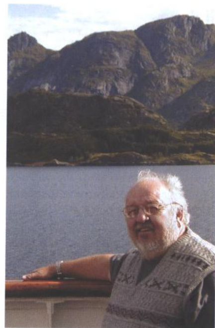
The trip around the fjords involves woodturning on the high seas