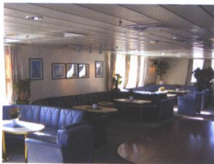
Interior of the MS GANN