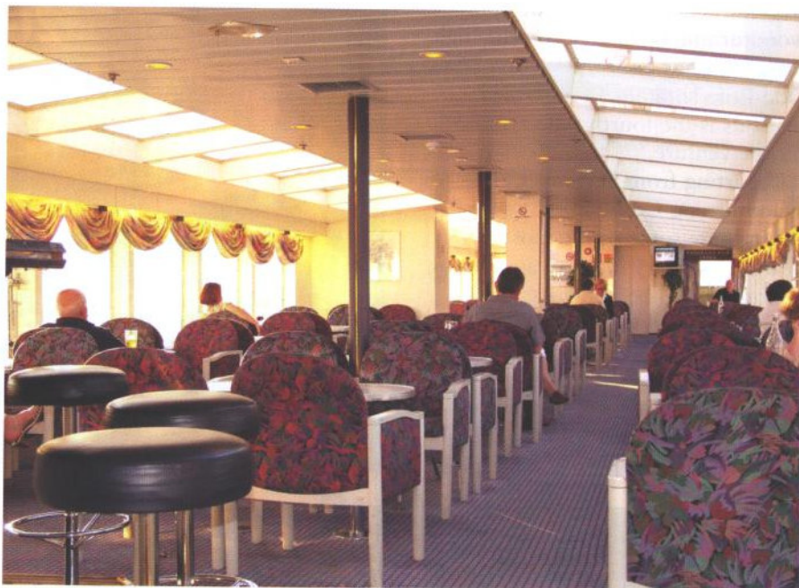
The Woodturning Cruise 2008 will see a more spacious MS GANN