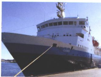
The MS GANN